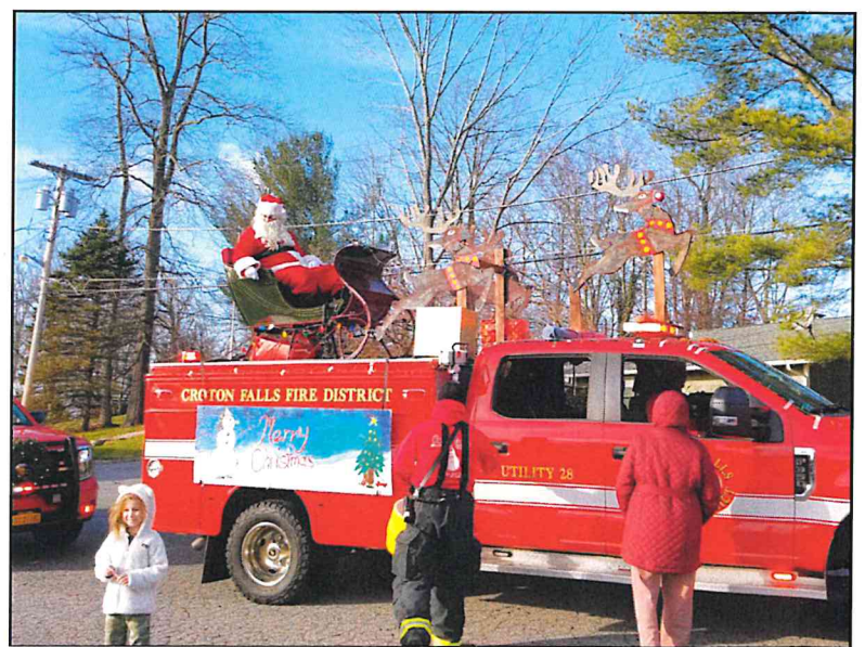
On Sunday, December 19 the Croton Falls Fire Department joined forces with Santa for the annual Candy Cane Run, stopping at our own Vails Grove Community.