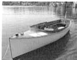
Boat Ramp/North End Storage