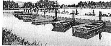
Boats etc. from Pat McGuinness

PLEASE SLOW DOWN!!!! Look at your speedometer as you drive, I bet many of you don't realize how slow 10 really is. For the SAFETY of all, SLOW DOWN!!!!!!